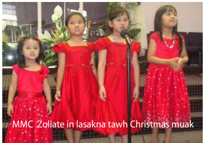
MMC Zoliate in lasakna tawh Christmas muak