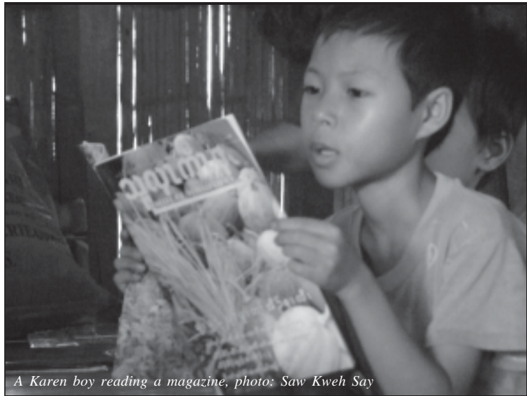
A Karen boy reading a magazine, photo: Saw Kweh Say

The last tactic used by the regime is promoting inter-ethnic marriages. Children of mix marriages (ethnic people who are married to Burman) are often referred to as ethnically Burman rather than from the ethnic nationalities. The children speak Burmese as a first lan-